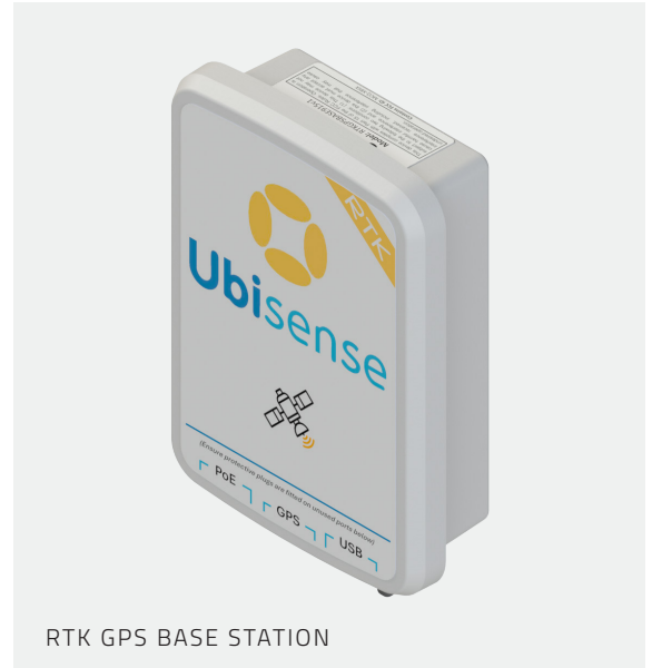
RTK GPS BASE STATION

A technician-replaceable internal battery maintains UWB tracking in a housekeeping mode (with multi-year lifetime) when the vehicle supply is disconnected for maintenance.