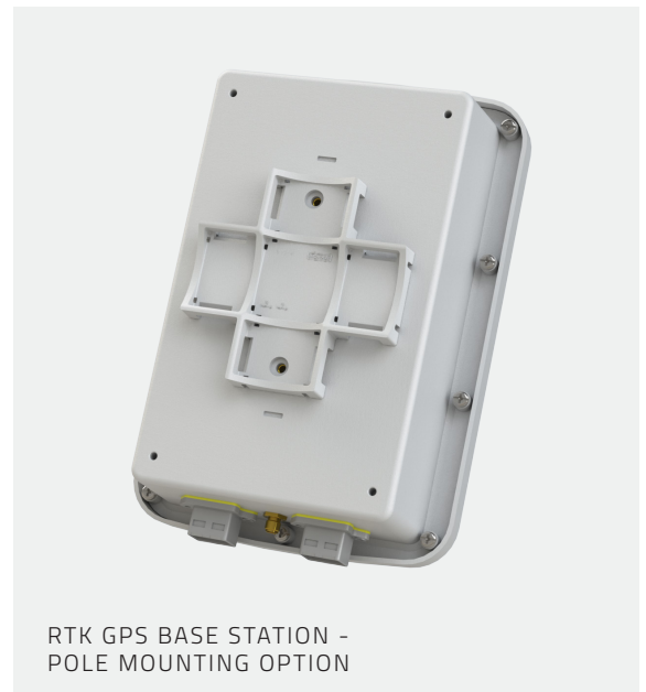
RTK GPS BASE STATION - POLE MOUNTING OPTION